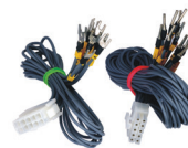
Controller-side Wire Harness & Module-side Wire Harness