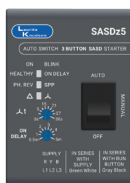
Variant compatible for 3 Button (Star-Delta-OFF) SASD STARTER