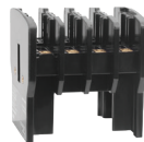
MU Spare Housing