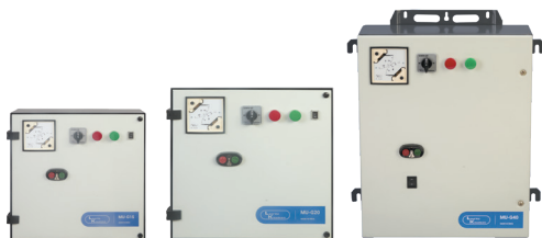
MU-G Three Phase Submersible Pump Controller

Submersible pump application, Residential pump application, Fire fighting pump application, etc.