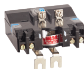
MU - 2P Relay