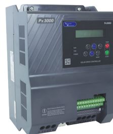
Px3000 Solar Drive Controller