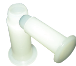
Relay Extension Knob