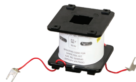
Standard Operating Coil ML2 / ML3