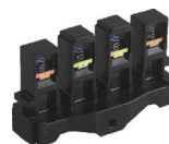
MU Contact Bridge