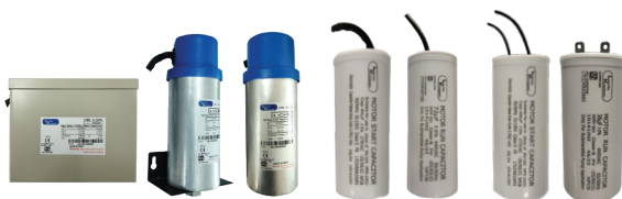
Power Factor Correction Capacitor