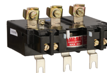
ML2 / ML3 Relay