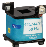
Standard Operating Coil ML1.5