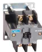
MU - 2P Contactor