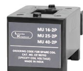
MU - 2P Coil