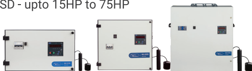
MU-GS SMART Controller