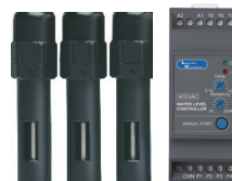
Water Level Controller