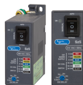
SPPR Type Sz5 (7 Wire & 6 Wire)