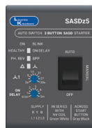
Variant compatible for 2 Button (ON/OFF) SASD STARTER