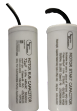
Start & Run Capacitors