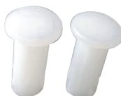
Spare ON-OFF plug